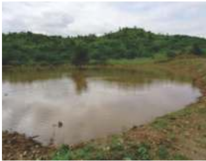
Construction of mini percolation tank & anicut