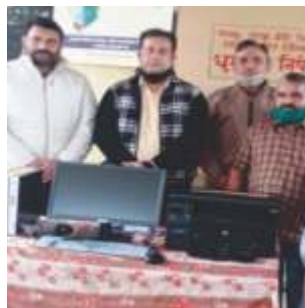
Computers + Printers