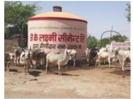
Construction of drinking water tanks for animals (Oru)