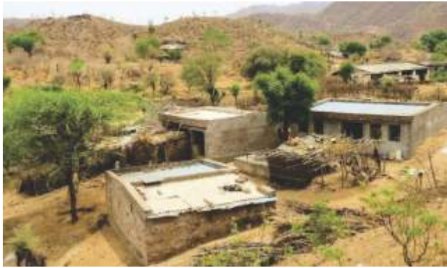
Project area is spread out with dispersed hamlets