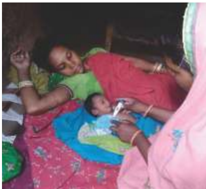
VLMs provide a range of RCH services including home-based newborn care for which they are trained