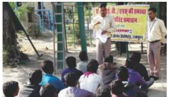
Awareness program on HIV/AIDS with truckers