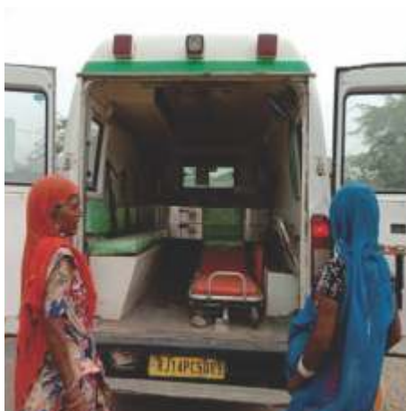
Referral to Government Hospital, Pindwara