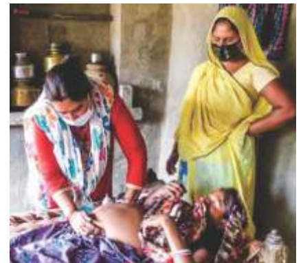
Project ANM visits home to provide care to beneficiaries