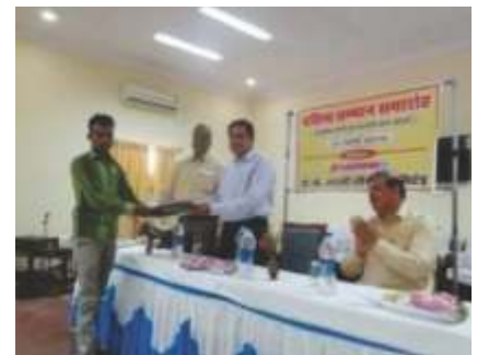
Pratibha Samman Recognition to Players (State/National Level)