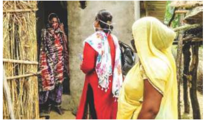
Antenatal & postnatal care is provided by home visit of VLM and ANM