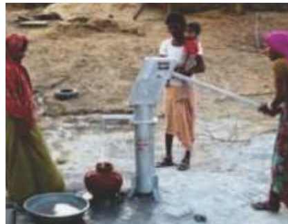
New hand pumps