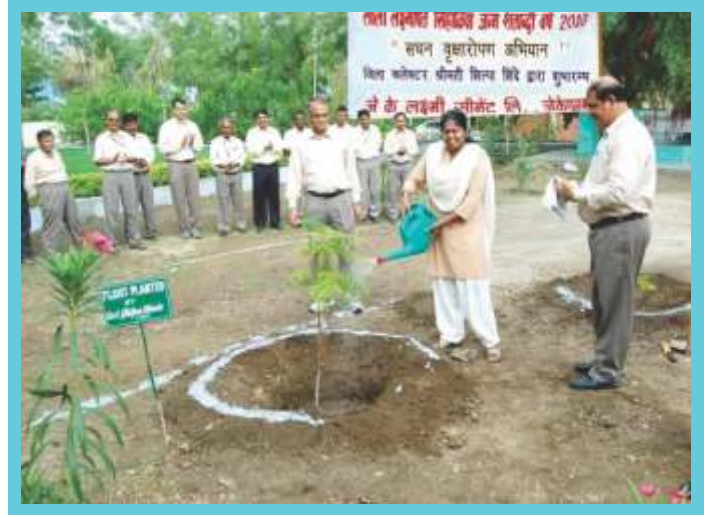
District Collector Shilpa Shinde Ji Participating in the Plantation Drive