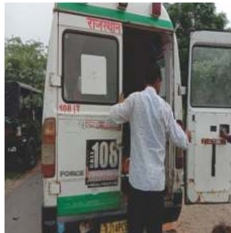
Called 108 Ambulance