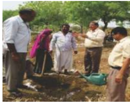
Plantation in community and near government schools