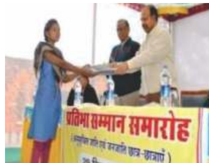
Pratibha Samman Merit Scholarship for SC/ST Students