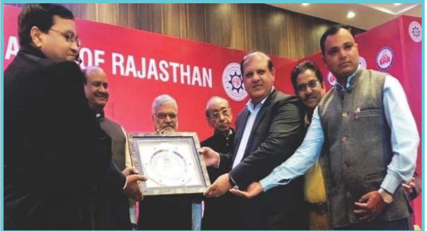
JK Lakshmi Cement, Sirohi Unit Awarded with Outstanding Performance in CSR Excellence Trophy 2021 by the Employers Association of Rajasthan