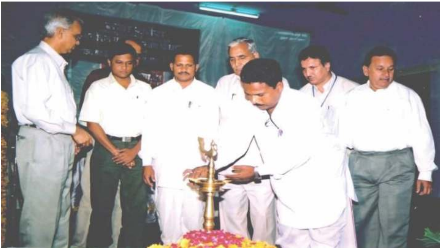
Inauguration of the Naya Savera project, 2004

We began our CSR journey with Naya Savera project.