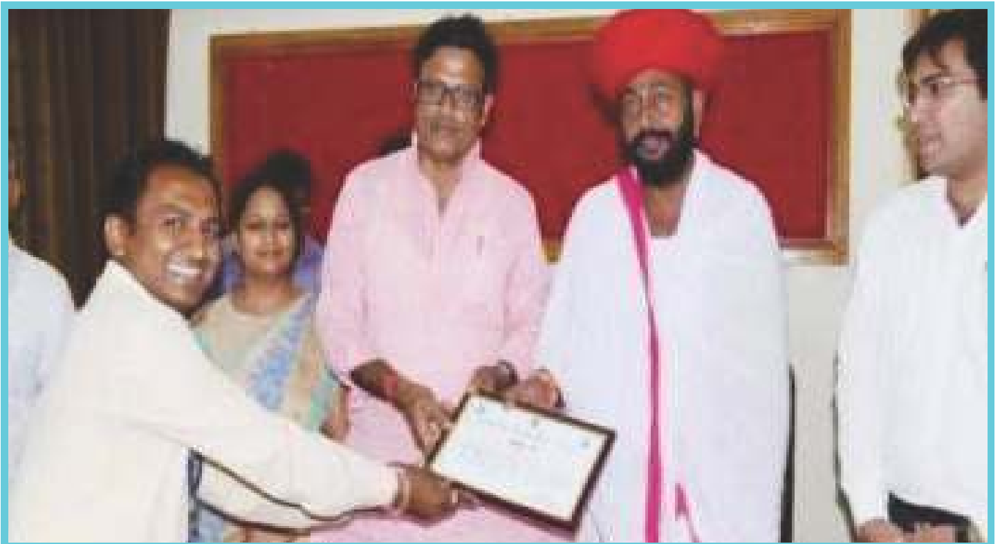
JK Lakshmi Cement Was Recognized by District Administration for Construction of Mini Percolation Tanks Under Mukhyamantri Jal Swavlamban Yojana