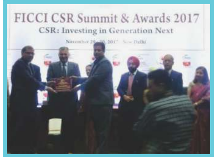
Awarded by FICCI for NAYA SAVERA, 2017