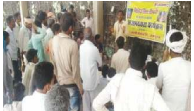
Awareness program on Silicosis in the community