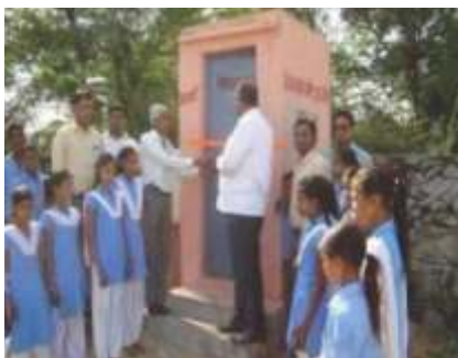
Toilet in school