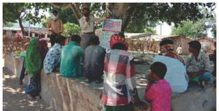
Community awareness on Covid-19