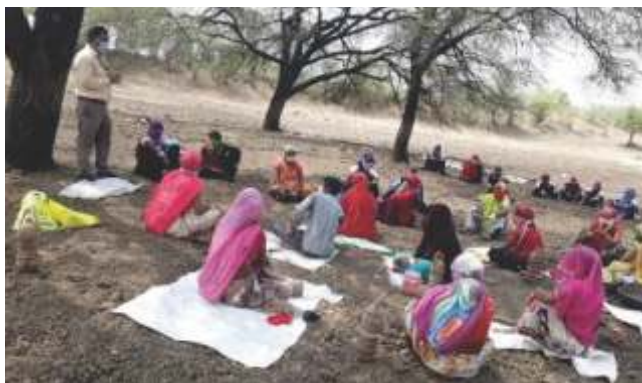
Awareness program on Silicosis in community