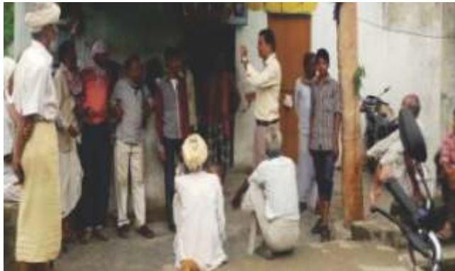
Awareness program on Silicosis in the community