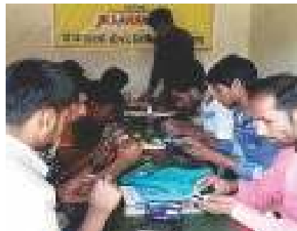
Mobile Repair Technician