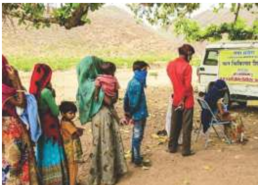
A doctor provides clinical services from a mobile clinic