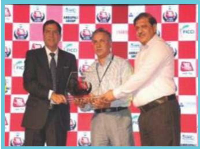
Awarded by TV Today Network, Aaj Tak Care Award for NAYA SAVERA, 2012