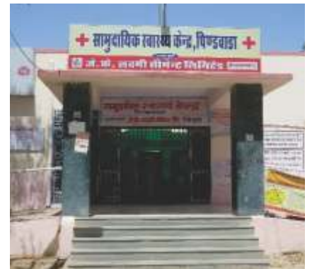
Liaison with government services ensures referral care