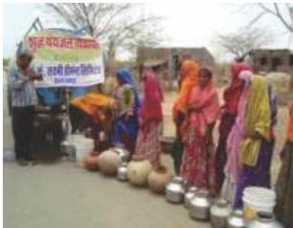
Water supply by tanker