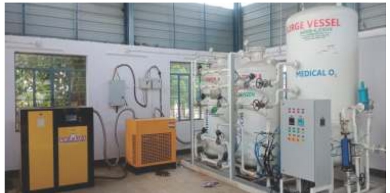
Oxygen plant set up at CHC, Pindwara

To mitigate the effect of Covid-19 pandemic in the community.