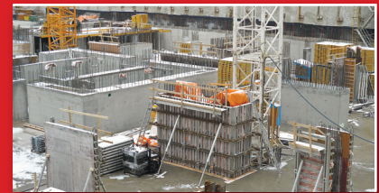
Heavy machinery foundation