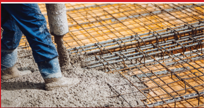
All types of RCC (Reinforced Concrete Cement) work