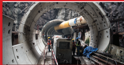
Underground structures (basements/underground metros)