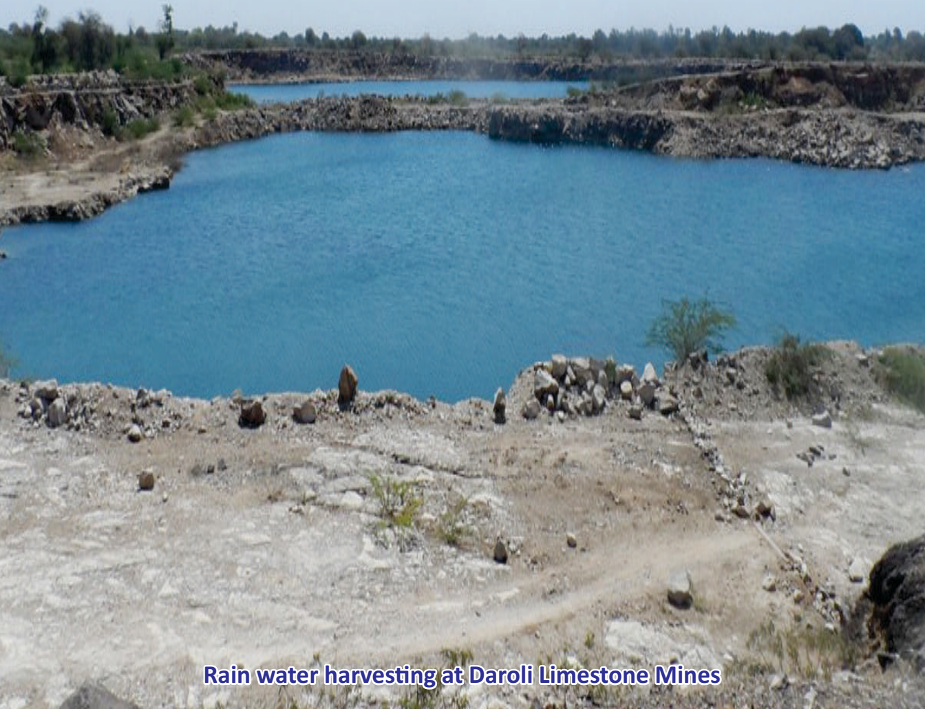
Rain water harvesting at Daroli Limestone Mines