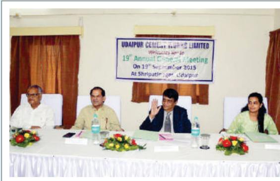
Directors on Dias attending 19th AGM