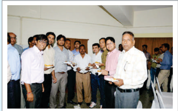
Members at High Tea after 19th AGM