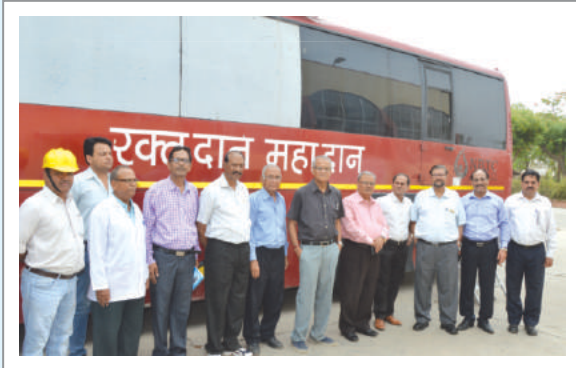
Blood Donation Camp at UCWL Plant