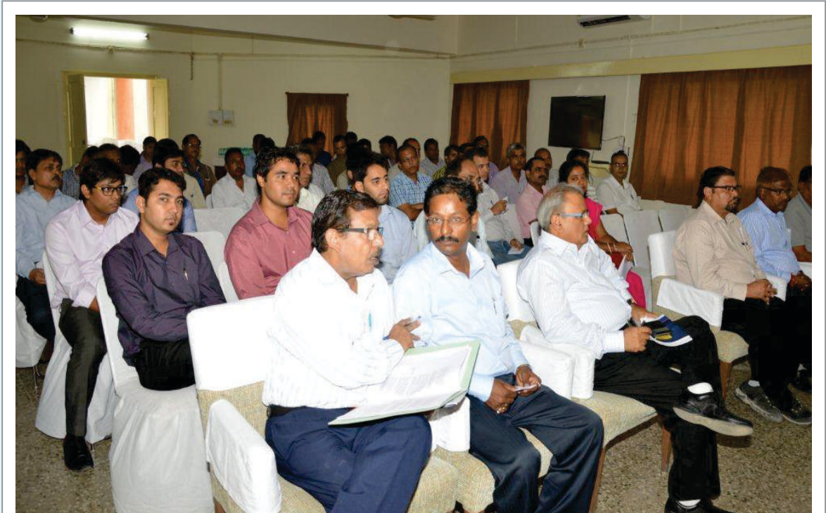
Members attending 19th AGM